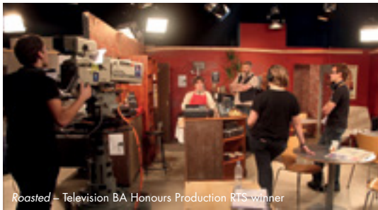
Roasted – Television BA Honours Production RTS winner