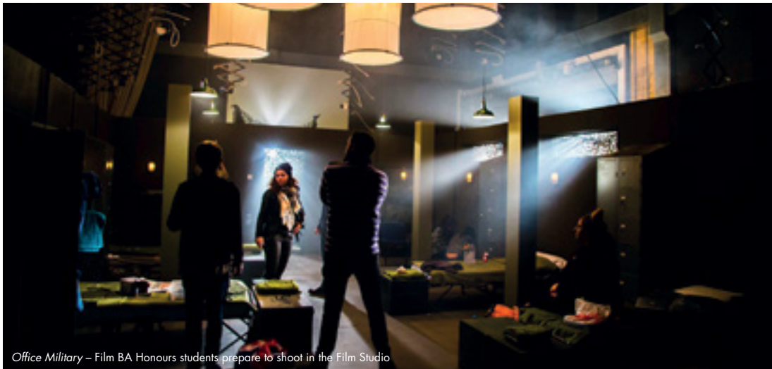
Office Military – Film BA Honours students prepare to shoot in the Film Studio