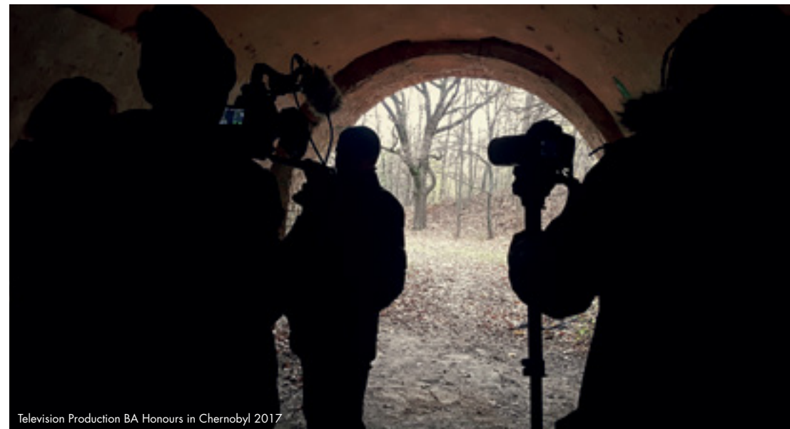
Television Production BA Honours in Chernobyl 2017