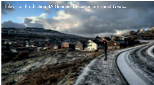
Television Production BA Honours Documentary shoot Faeros