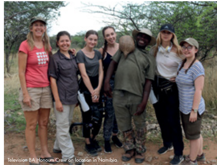
Television BA Honours Crew on location in Namibia