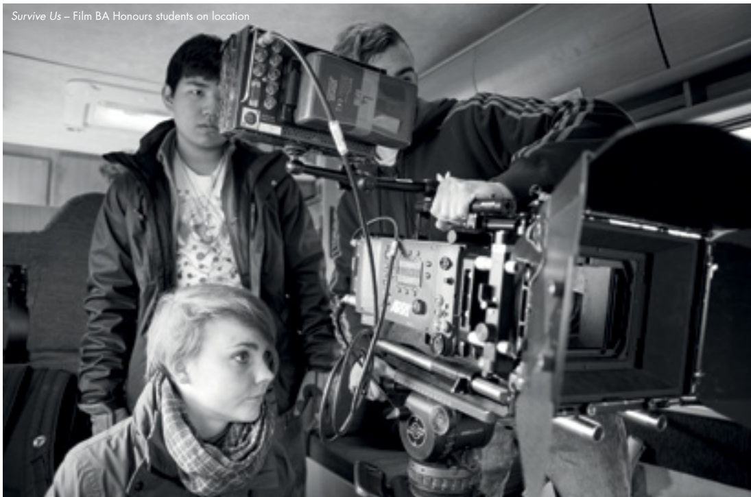
Survive Us – Film BA Honours students on location