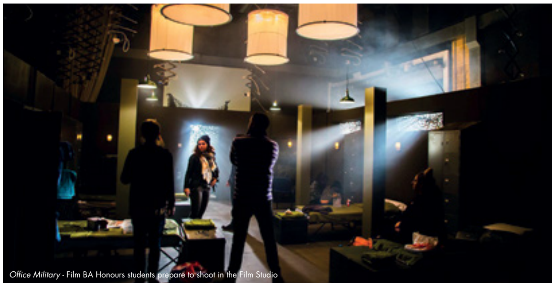
Office Military - Film BA Honours students prepare to shoot in the Film Studio