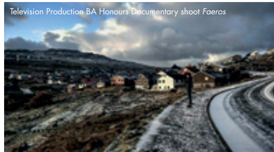
Television Production BA Honours Documentary shoot Faeros