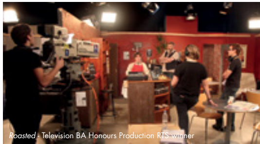
Roasted - Television BA Honours Production RTS-winner