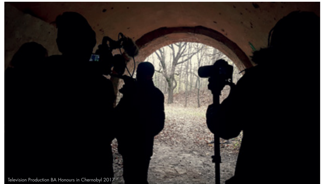
Television Production BA Honours in Chernobyl 2017