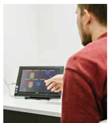
Psychology facilities at Cavendish Campus