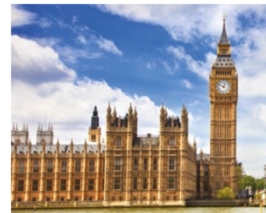
Our central London location makes us the perfect choice to study politics

For module information and further details, please visit: westminster.ac.uk/politics-and-international-relations