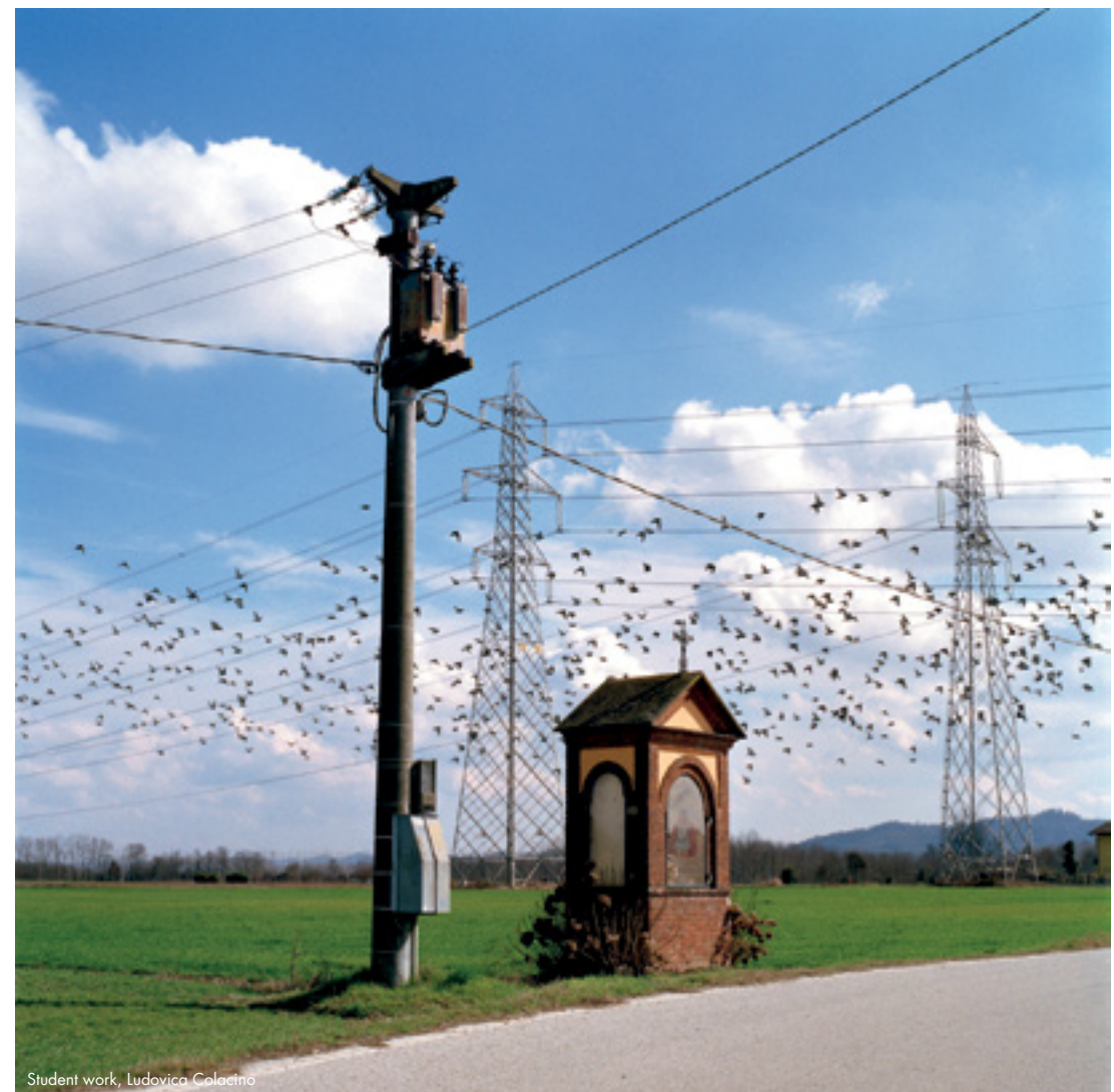
Student work, Ludovica Colacino