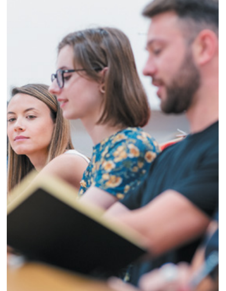
100% of our M-Law graduates are in a professional or managerial job within six months of graduating