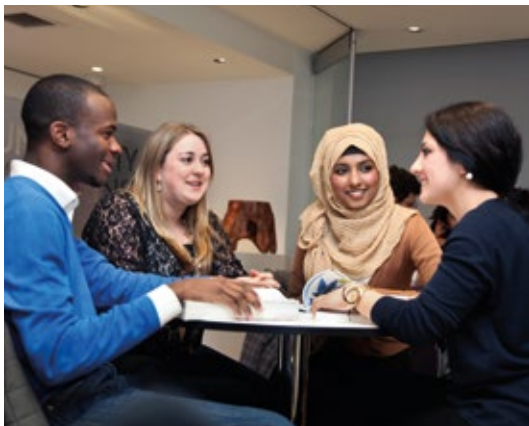
Café, Little Titchfield Street site

For module information and further details, please visit: westminster.ac.uk/law