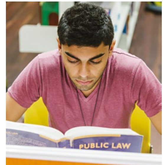
Regent Library, Little Titchfield Street site

For module information and further details, please visit: westminster.ac.uk/law