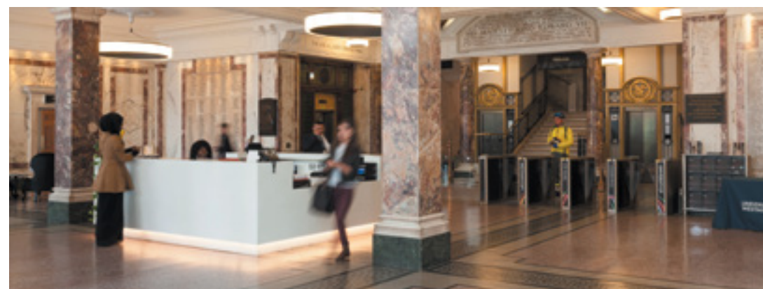
Social and study spaces at Regent Campus

Data taken from westminster.ac.uk in December 2018