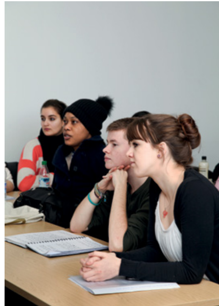
Library and lecture rooms at Marylebone Campus

90% of our Business Management – Accounting graduates are in work or further study within six months