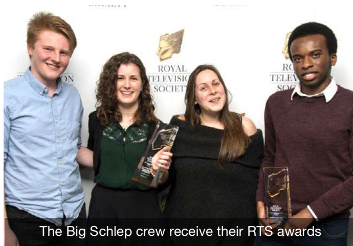
The Big Schlep crew receive their RTS awards