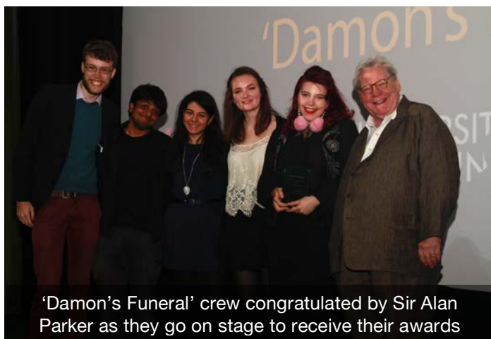
'Damon's Funeral' crew congratulated by Sir Alan Parker as they go on stage to receive their awards