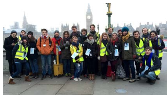
Students working as location marshals on Top Gear close off the Mall for the Hoonicorn Shoot hosted by Matt Le Blanc in London in May