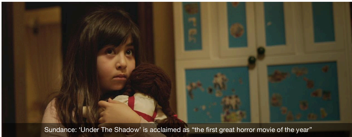
Sundance: 'Under The Shadow' is acclaimed as "the first great horror movie of the year"