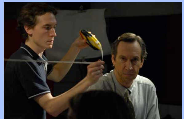
Jonathan Hyde gets ready for his close-up