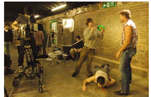
Above- the crew prep for a take on the set of 'Tears of the Son'