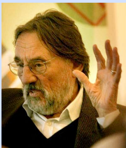
Above- Academy Award winning DoP Vilmos Zsigmond ('Close Encounters of the Third Kind', 'The Black Dahlia')

Westminster Film School teamed up with HKW Berlin to secure EU Media funding for the 9th biannual Budapest Cinematography Masterclass, held at the Korda Studios in Hungary. Sixteen scholarships were awarded to exemplary young cinematographers - and both UK scholars were Westminster alumni.