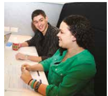
Study area, Regent Campus

A Levels – BB/BBC including English; International Baccalaureate – 30 points including a minimum of 5 in Higher English; Edexcel BTEC Level 3 Extended Diploma – DDM/Diploma DD with A Level English. If your first language is not English you must have an IELTS score of 6.5 overall with 6.5 in each element or equivalent. See also entry requirements on p233.