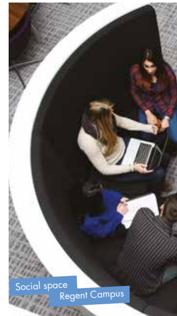
Social space Regent Campus

>> See also: History p120 • Languages p132 • Linguistics p144