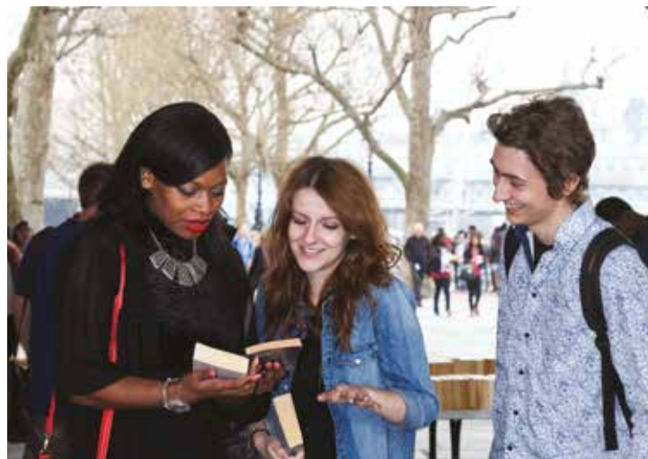
Book Fair, Southbank, London

In the second and third years you will extend and deepen your critical skills and your knowledge of the forms, history and context of literature. A wide range of topics is offered, such as American literature, contemporary writing, fantasy, Gothic, post-colonial writing, Romanticism, theatre studies, tragedy, travel writing, and writing and gender.