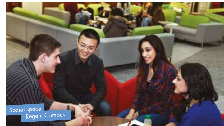
Social space Regent Campus

92% of English Language and Literature students said staff made the subject interesting