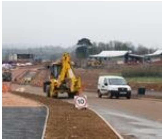
Infrastructure funding: LIF