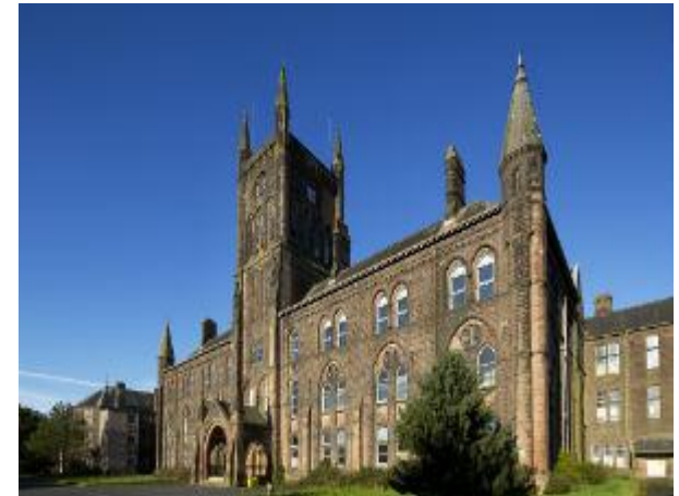
Build Now Pay Later: Public Land