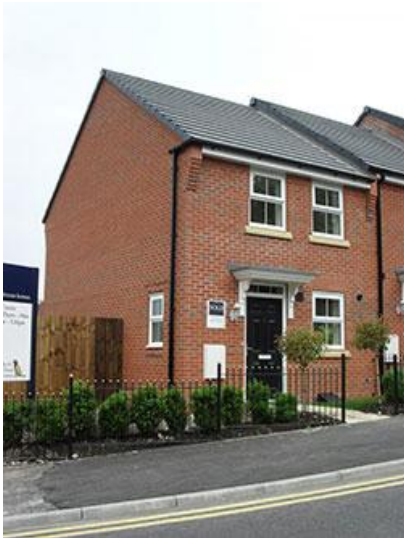
Development Finance: GBB